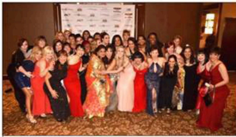
Ladies of the Global Sisterhood!